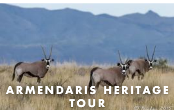
ARMENDARIS HERITAGE TOUR

From canyons to caves, our hikes are designed for various levels of ability, all while providing picturesque views of both mountains and along the Rio Grande Valley.