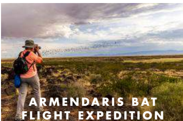
ARMENDARIS BAT FLIGHT EXPEDITION

$500 for 2 people; $100 for each additional person (max 4 total) Additional $50 per hour charge for extended touring time.