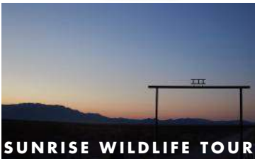
SUNRISE WILDLIFE TOUR

Bike along ridge crests and streams on our state-of-the-art, full suspension mountain or e-bikes. Various levels of difficulty depending on track.