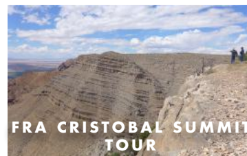
FRA CRISTOBAL SUMMIT TOUR

Learn about the geological and human history of Armendaris while traveling through the Chihuahuan Desert habitat in an open-air vehicle. Great potential for wildlife encounters along the way.