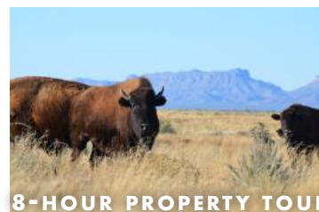
8-HOUR PROPERTY TOUR

Don't want to leave? We don't blame you! Spend all day exploring either property, Ladder or Armendaris on your own customized itinerary!