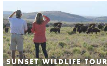
SUNSET WILDLIFE TOUR

Early risers have an excellent chance to spot bison, elk, javelinas, deer and more of Ladder's diverse wildlife, with prime photographic moments along the way.