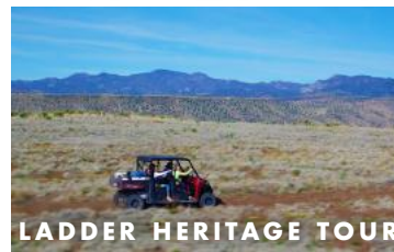
LADDER HERITAGE TOUR

Ladder is one of the finest birdwatching sanctuaries in North America, rich in native wildlife and biodiversity. Our expert birding guides are waiting for you!